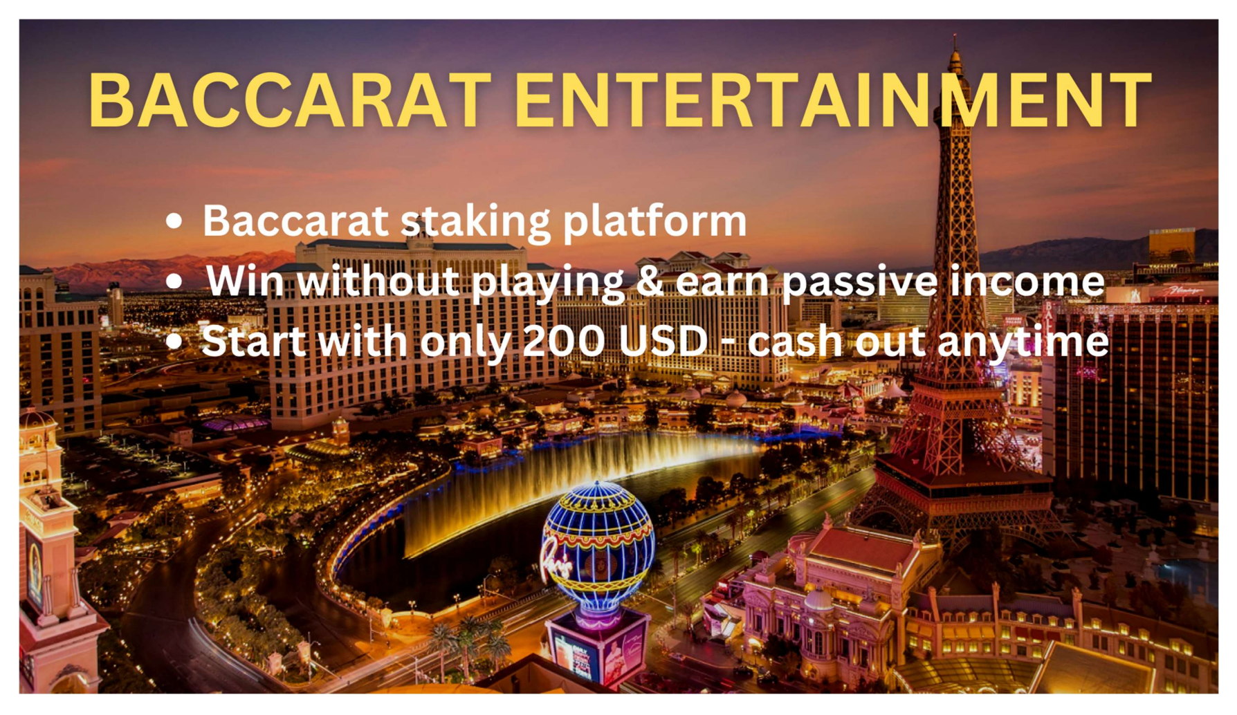
Complete guide to Baccarat staking. For more details please get back to the person who sent you this PDF.